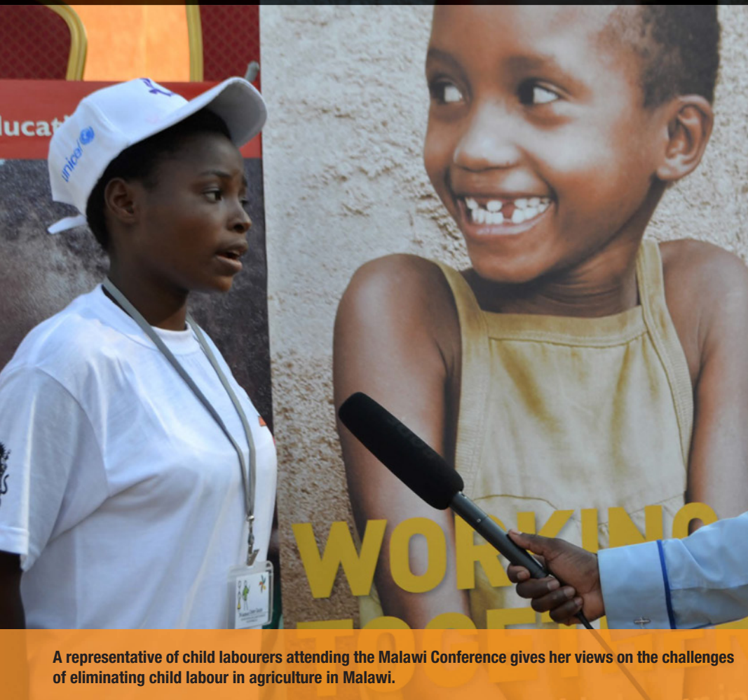
A representative of child labourers attending the Malawi Conference gives her views on the challenges of eliminating child labour in agriculture in Malawi.

The commitments made at the Malawi National Conference on Child Labour in Agriculture in 2012 continued to inspire action against child labour in 2013. Government, inter-governmental organizations, and civil society have marched forward with conference directives, and the National Steering Committee on Child Labour was reconvened.