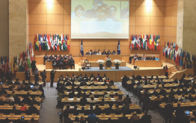
Malawi President Joyce Banda addressing the 102th Session of the ILO Conference in Geneva on 12 June 2013.